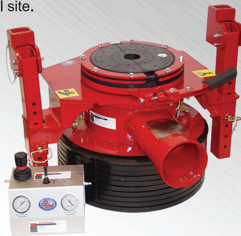
3000-12T3 Pneumatic Section Deflated, Brackets Retracted with Stripper Rubber Closed and Control Unit

The 3000-12T3 is manufactured to mount on an Ingersoll Rand T3W. The special base plate and mounting brackets allow the unit to be transported under the rig table, high enough not to strike the ground surface. The special mounting brackets will also enable the unit to be swiveled out from under the rig table to aid clearing the casing when driving off well site.