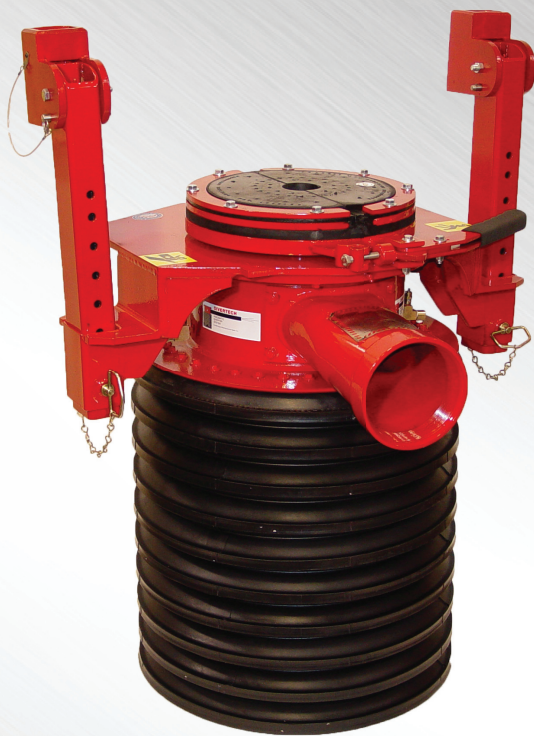
3000-12T3 Pneumatic Section Inflated, Brackets Extended with Stripper Rubber Closed

The 3000-12T3 is manufactured to mount on an Ingersoll Rand T3W. The special base plate and mounting brackets allow the unit to be transported under the rig table, high enough not to strike the ground surface. The special mounting brackets will also enable the unit to be swiveled out from under the rig table to aid clearing the casing when driving off well site.