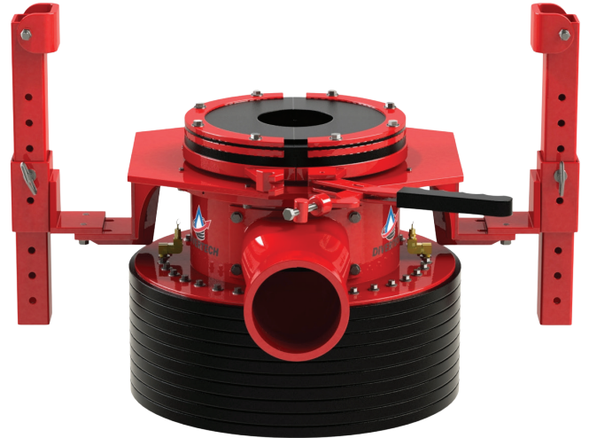
3000-12ST Pneumatic Section Deflated, Brackets Retracted with Stripper Rubber Closed

With a 10-tube Pneumatic Assembly and extendable mounting brackets, the 3000-12ST is quite universal when considering all drilling application requirements. The flow line can be rotated to direct drill cuttings where you want them. The 3000-12ST can be utilized on terrain that is up to 20° out of level. The 3000-12ST comes complete with Control Unit, Primary Inline Regulator and Air Lines.